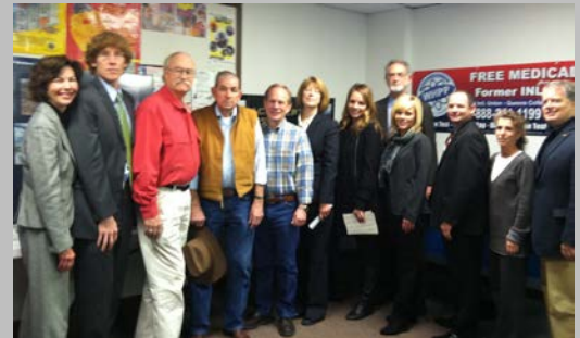
INL ELCD Event

For former workers, occupational exposure to lung carcinogens, such as asbestos, uranium, plutonium, and beryllium, makes them potentially at elevated risk for developing lung cancer. The ELCD program will utilize low-dose CT scans to detect lung cancer at an early stage when it is more treatable. The lung cancer screening program expands the Worker Health Protection Program (WHPP). WHPP is jointly conducted by Queens College of the City University of New York, the United Steelworkers, and the Atomic Trades and Labor Council. For more information on WHPP, visit www.worker-health.org . ■