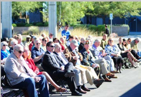
National Atomic Testing Museum National Day of Remembrance Event

With public sentiment, nothing can fail; without it, nothing can succeed.