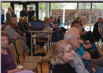
Participants at the Hanford event listened to remarks from Congressman Doc Hastings' District Representative followed by a reception, highlighting a historical Hanford display compliments of a local Hanford historian.