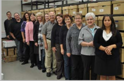
Richland EEOICPA Staff and Indexing Team

We are very excited about this project - it will allow the DOL District Office claims representatives to "triage" claims. When this information is added to the data from the dosimetry records and badging system, that they already have on-line access to, they will experience greater efficiencies and accuracy in directing searches. They'll have a significant amount of information on the first day and cut significant wasted efforts (and money). As we begin a new SEC increase in claims, this product will hopefully allow us to keep up the turnaround time (currently approximately 20 - 25 days for employment verifications and DAR) without any incremental funding or staffing.