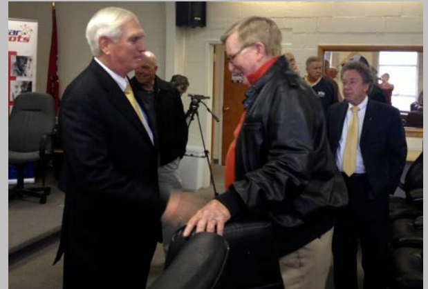
Congressmen John Duncan (pictured) and Chuck Fleischmann, Tennessee, attended the NDR event held in Oak Ridge.

Featuring numerous quilt squares of SRS patriots, CWP shared the quilt on display for the 2000-plus attendees of the annual SRS 25-year Employee Receptions in Augusta, GA, earlier this month before taking it on the road to National Day of Remembrance celebrations across the U.S.